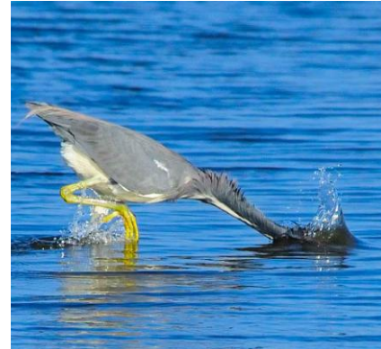
The strike is swift, a fraction of a second.