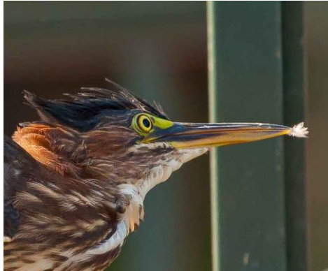
The bill of the Heron is shaped like a dagger, with a very sharp tip.