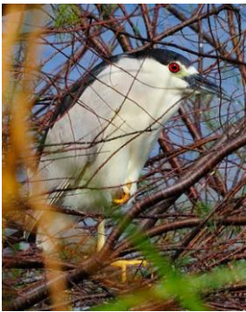
Black Crowned Night

“Hérons” are the subject of this edition. On every National Wildlife Refuge, where there is water, very likely you will see a Heron standing majestically doing nothing. If time is spent watching a Heron, you will see a very swift stabbing move with its dagger like bill, and dinner is served. Pictures of various Herons are shown below, along with some Heron action.